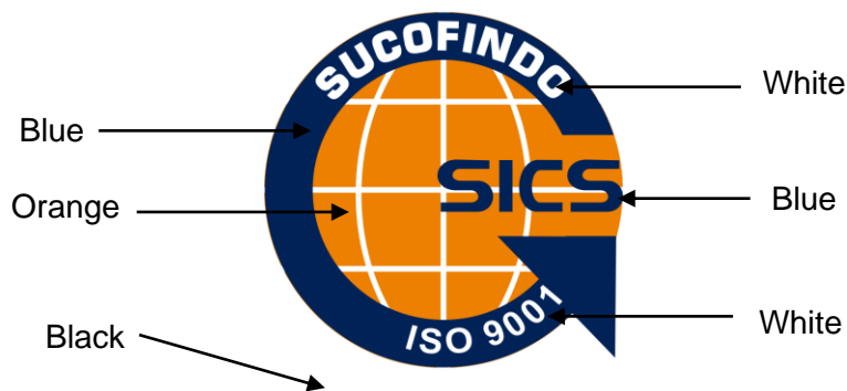
Certificate No.: QSC nnnnn Figure 2a