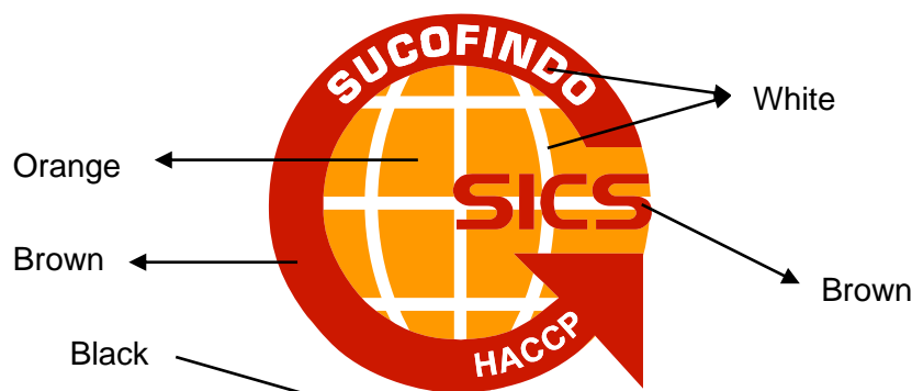
Certificate No.: FSC nnnnn Figure 2c

d) Information Security Management System Certification (ISO 27001)