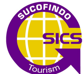
Certificate No.: TCS nnnn Figure 3f