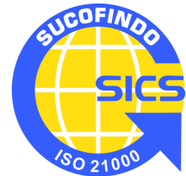
Certificate No.: EOMS nnnn Figure 3g