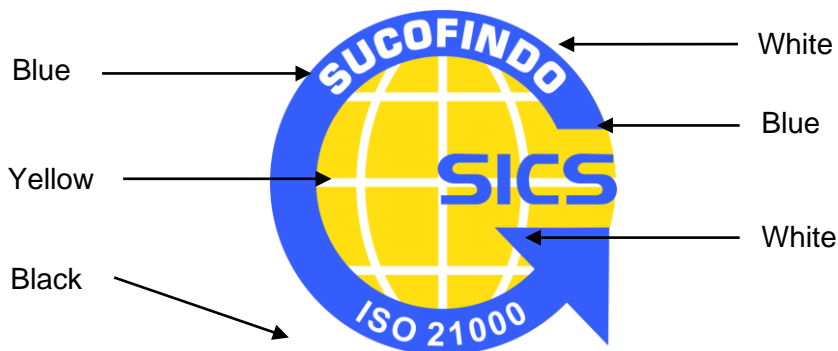
Certificate No.: EOMS nnnnn Figure 2g